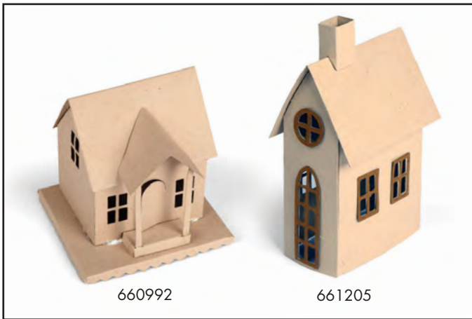
1. This die is designed to be used with the Village Dwelling die (660992) or Village Brownstone die (661205).