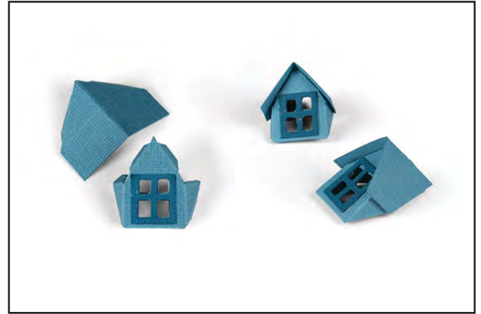
4. To build the Dormers, first adhere the window frame to the front of the dormer body. Fold the side flaps and tabs of the dormer body. Adhere roof to tabs on the top of the side flaps and at the top of the window. The back edge of the roof should align with the side of the dormer.