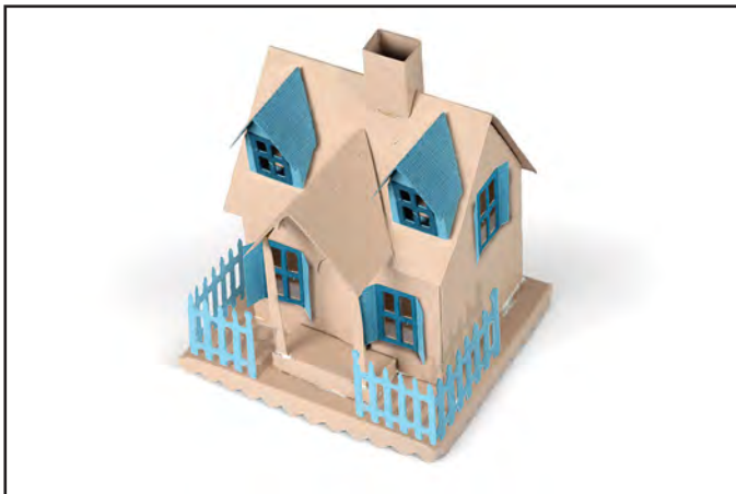
5. Adhere Dormers and Shutters to dwelling. Fences can be linked together to create desired lengths.