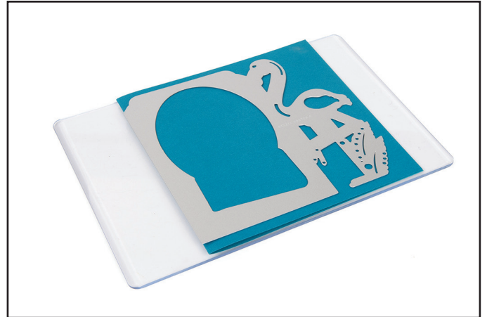
2. Place the folded cardstock on the Cutting Pad with the straight edge opposite the flamingos just past the edge of the fold.