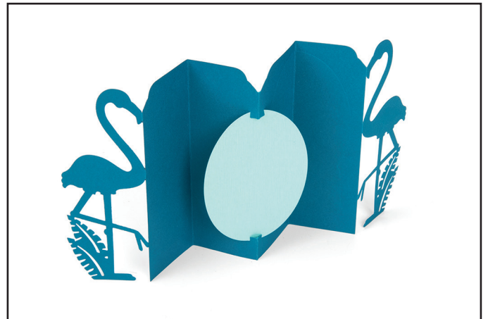
4. The center cutout is designed to fit between the top and bottom tabs in the center of the card.