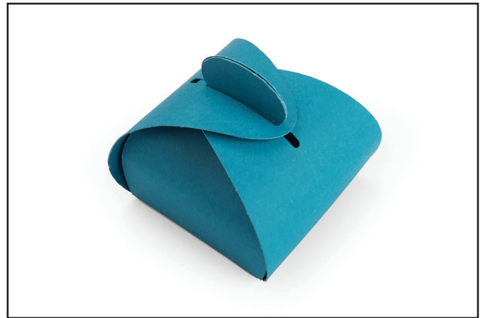
4. Embellish as desired.